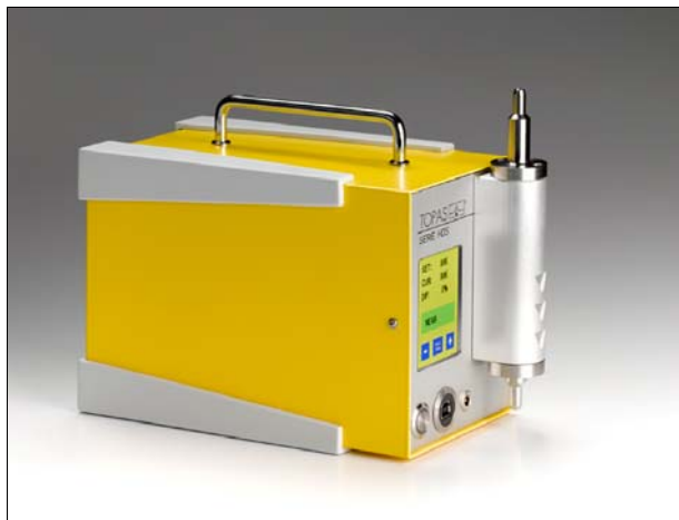
High Dilution System HDS 561

The High Dilution System HDS 561 is designed for measuring problems requiring very high and adjustable dilution factor. Due to the improved accuracy of the new dilution principle a very high degree of reliability and reproducibility is guaranteed.