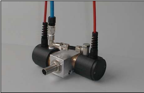
Mixing Chamber and Ionization Heads

The EAN 581 has been designed to be used in conjunction with a wide range of aerosol generators. Because particles from dust dispersers usually carry several thousand elementary charges the EAN 581 is an invaluable accessory for perfectly match as an accessory for the range of Topas dust and fibre dispersers in the SAG Series as well as devices other manufacturers'.