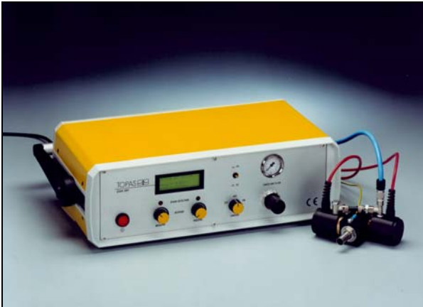
Electrostatic Aerosol Neutralizer EAN 581

The mechanical interaction of particles, especially solid ones, may cause undesirable levels of electrostatic charge. Test dusts must be generated with a high degree of reproducibility for instance when evaluating aerosol separation techniques such as cyclones, filters or impactors. Comparable results can only be obtained at controlled and similar charge levels. The electrostatic aerosol neutralizer EAN 581 conditions the charge distribution on test dusts as well as other aerosols. Charge equilibrium can be controlled by mixing positive and negative ions in a precise manner.