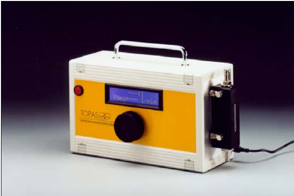
Dynamic Dilution System Series DDS 560

There are many measuring tasks where particle size and particle number are to be determined even at high concentrations. Particle counters are not designed for such concentrations, i. e. they will then work in the coincidence range and not provide reproducible results. Due to an upstream defined dilution of the aerosol, this measuring technique can now also be used for high concentrations. For this field of application Topas provides the Dilution System Series DIL. These devices have a fixed dilution ratio and are calibrated for the total volume flow rate of the particle counter.