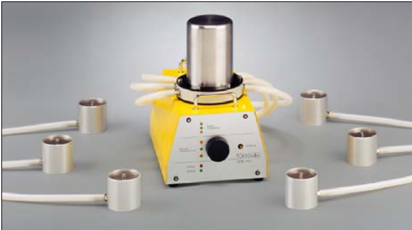
Aerosol Distribution and Dilution System ADD 536

Hospital operating rooms are specially designed to avoid contaminations and therefore additional infections of patients during operations. To assure a low level of particle contaminations a laminar air flow is applied to the operating table. To verify the retention efficiency of this flow regime a verification with a defined test aerosol is required according to the standards DIN 1946-4 and SWKI 99-3. For that reason a total particle rate of 6.3 \cdot 10^7 P/min has to be distributed to six different positions and emitted with a reliable long term stability. From the standards it is also required that this total particle rate is continuously monitored and controlled by a particle counter. The Topas Aerosol Distribution and Dilution system ADD 536 meets all these required demands for providing a defined test aerosol with the following features: