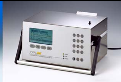
Particle Counter LAP340