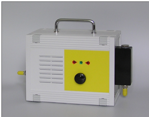
Sampling system for pressure lines SYS 525

The sampling system SYS 525 is used for purity control of ultra-pure gas supply systems and complies with the VDI 2083/7 standard in all its structural design requirements.