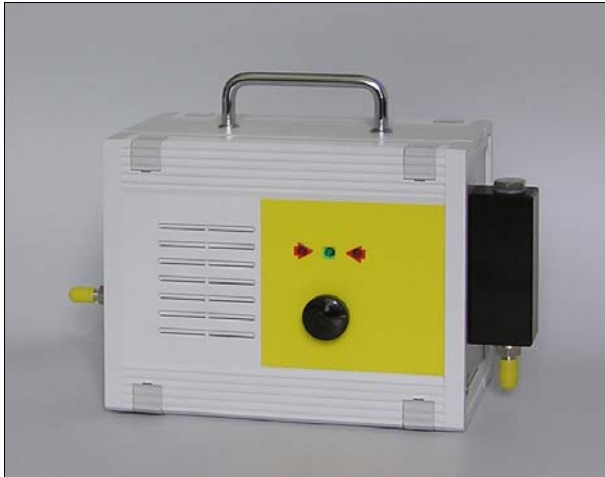
Sampling system for pressure lines SYS 525

The sampling system SYS 525 is used for purity control of ultra-pure gas supply systems and complies with the VDI 2083/7 standard in all its structural design requirements.