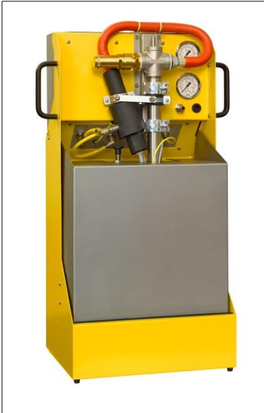
Polystyrene Latex (PSL) Aerosol Generator