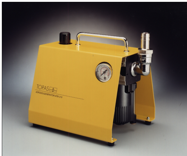
Atomizer Aerosol Generator ATM 210

The ATM 210 aerosol generator produces aerosols with known properties in accordance with the guideline VDI 3491. This special model facilitates generation of aerosols into pressurised vessels (up to 10 bar). Its design ensures a highly stable particle size distribution and concentration with high reproducibility and a high aerosol output.