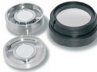
Spare set of impactor collection plates for easy reloading