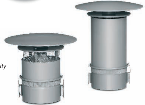
TSP and PM10 inlets for air quality measurements