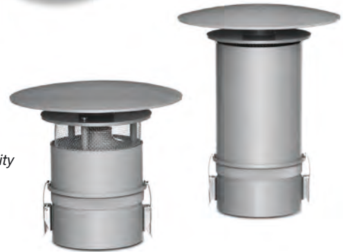
TSP and PM10 inlets for air quality measurements