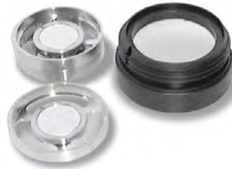
Spare set of impactor collection plates for easy reloading