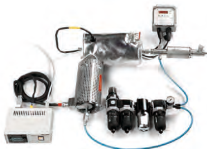
Dekati® Double Diluter setup for combustion measurements