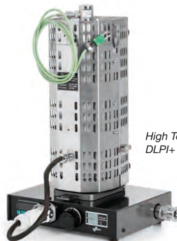
High Temperature DLPI+

Dekati Ltd. Tykkitie 1 FI-36240 Kangasala, Finland Tel. int. +358 3 3578 100 E-mail sales@dekati.fi www.dekati.fi