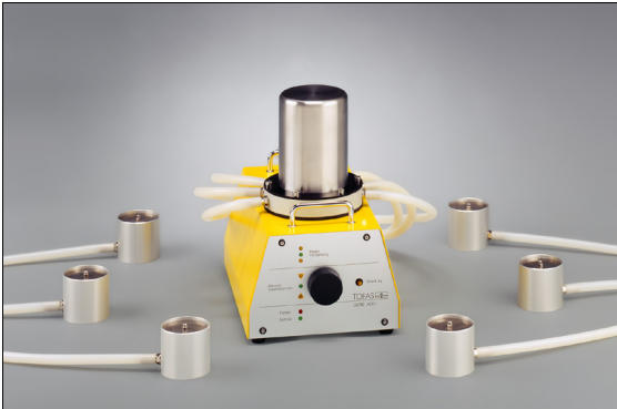
Aerosol Distribution and Dilution System ADD 536

Hospital operating rooms are specially designed to avoid contaminations and therefore additional infections of patients during operations. To assure a low level of particle contaminations a laminar air flow is applied to the operating table. To verify the retention efficiency of this flow regime a verification with a defined test aerosol is required according to the standards DIN 1946-4 and SWKI 99-3. For that reason a total particle rate of 6.3 \cdot 10^9 P/min has to be distributed to six different positions and emitted with a reliable long term stability. From the standards it is also required that this total particle rate is continuously monitored and controlled by a particle counter. The Topas Aerosol Distribution and Dilution system ADD 536 meets all these required demands for providing a defined test aerosol with the following features: