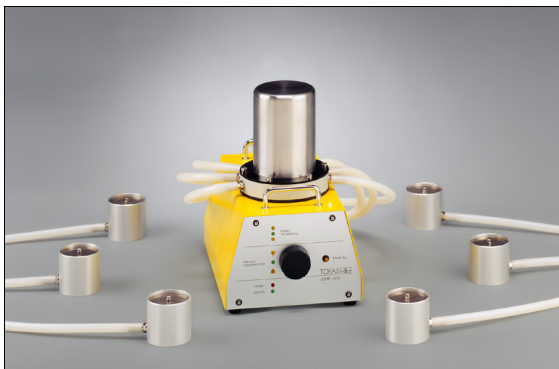
Aerosol Distribution and Dilution System ADD 536

Hospital operating rooms are specially designed to avoid contaminations and therefore additional infections of patients during operations. To assure a low level of particle contaminations a laminar air flow is applied to the operating table. To verify the retention efficiency of this flow regime a verification with a defined test aerosol is required according to the standards DIN 1946-4 and SWKI 99-3. For that reason a total particle rate of 6.3 \cdot 10^9 P/min has to be distributed to six different positions and emitted with a reliable long term stability. From the standards it is also required that this total particle rate is continuously monitored and controlled by a particle counter. The Topas Aerosol Distribution and Dilution system ADD 536 meets all these required demands for providing a defined test aerosol with the following features: