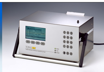
Partikelzähler LAP 340