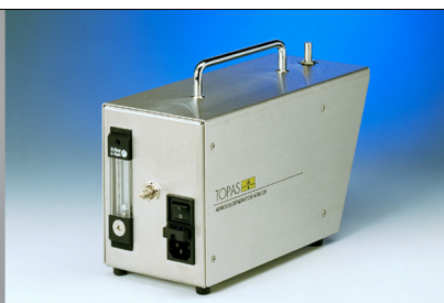
Aerosol Generator ATM 226