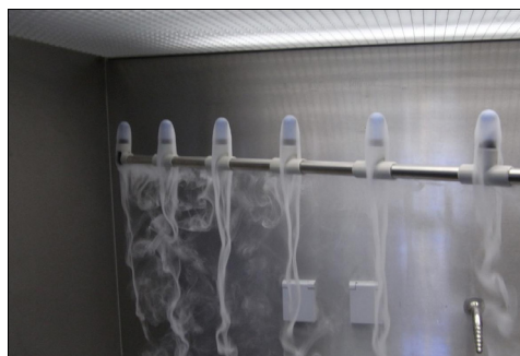
Aerosol distributing rake with outflowing aerosol