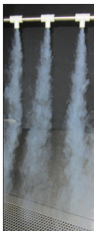
Turbulent output via tube outlet