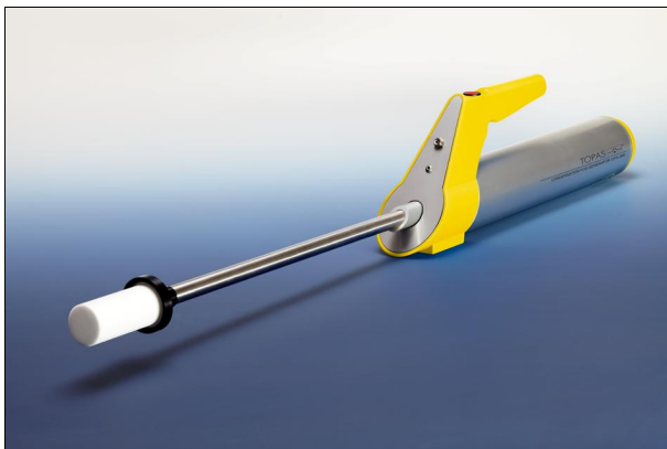
Condensation Fog Generator CFG 290

The hand-held Condensation Fog Generator CFG 290 has been designed for use in clean rooms and for visualisation of air flows according to ISO 14644-3 Annex B7 and VDI 2083-3.