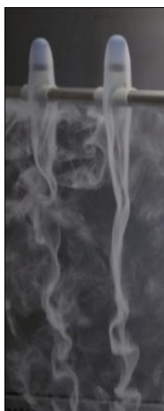
Laminar output via porous surface