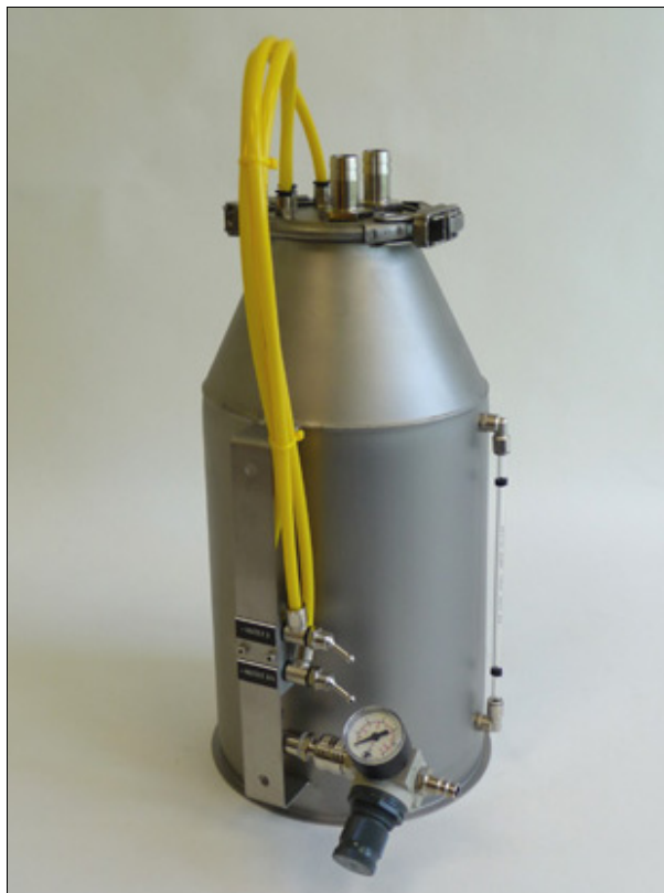
Aerosol Generators series ATM 241

The aerosol generator ATM 241 is a droplet generators and especially developed for generating high aerosol concentrations with exceptional constancy (VDI-guideline 3491).