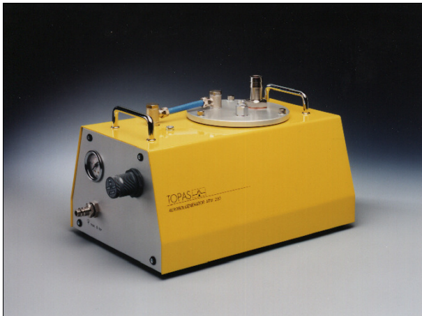
Atomizer Aerosol Generator ATM 230